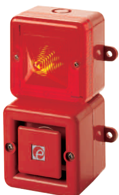
AL100SONTELFASH Combination telephone initiated alarmsounder and Xenon beacon.